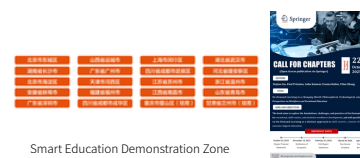
Smart Education Demonstration Zone

Explore the methodology of integrating ICT into education with large-scale experiments; Study on the solutions of smart classroom and smart campus; Provide the services for transferring education through the bridge of the theory and practice.