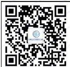
Smart Learning Institute WeChat QR Code

— Dean Ronghuai Huang, delivered at the closing ceremony of the Second US-China Smart Education Conference on March 20, 2017