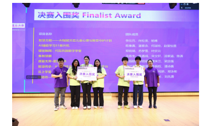
Excellence Award winners group photo Finalist Award winners group photo

The 8th Global Future Education Design Competition (Vocational Track) concluded successfully after two days of competition and dialogue on vocational education's future. Participants used design and intelligent technologies to address real-world and global challenges across classrooms, industry, technology, and society. Moving forward, it will continue uniting universities, industry partners, and international organizations to deepen the integration of design thinking and intelligent technologies in vocational education. We hope its innovations and young talents will flourish on a broader stage, fostering a more open, inclusive, and sustainable education ecosystem and empowering vocational students worldwide to become globally-minded professionals and innovators.