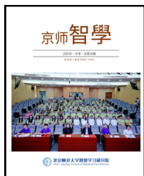
Winter 2025, ISSUE No.36